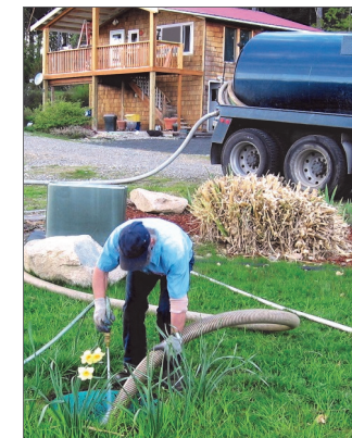
All septic systems require maintenance!

manage your pasture and manure in ways that will improve pasture productivity and protect water quality. Contact them at 360-428-4313.